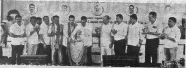
Minister for Public Works C C Patil and others at a programme in Mangaluru